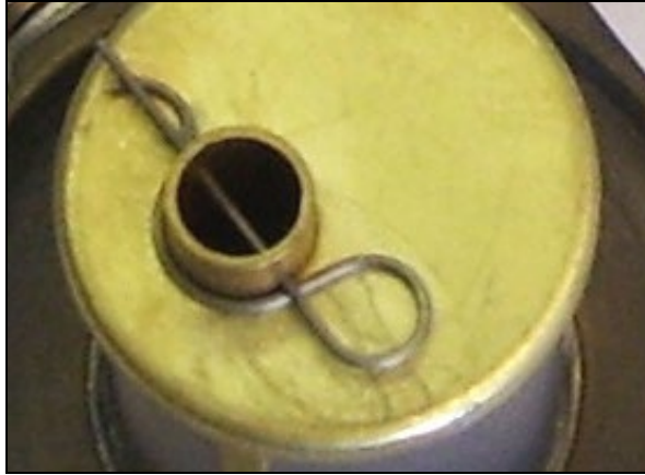
Figure 1. Correct Installation of Pin; Curved tail is installed under the straight tail.