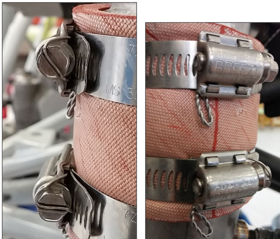
Figure 2. Safety Installation (over the screw slot)