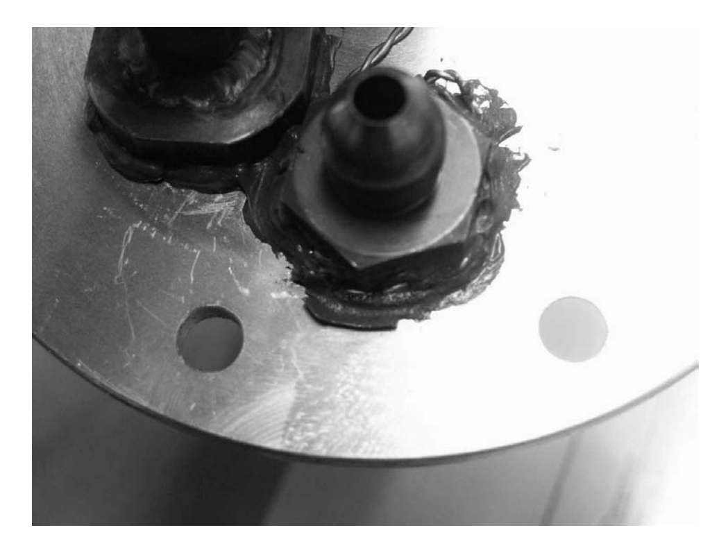
Figure 1 - Interference Caused by Sealant