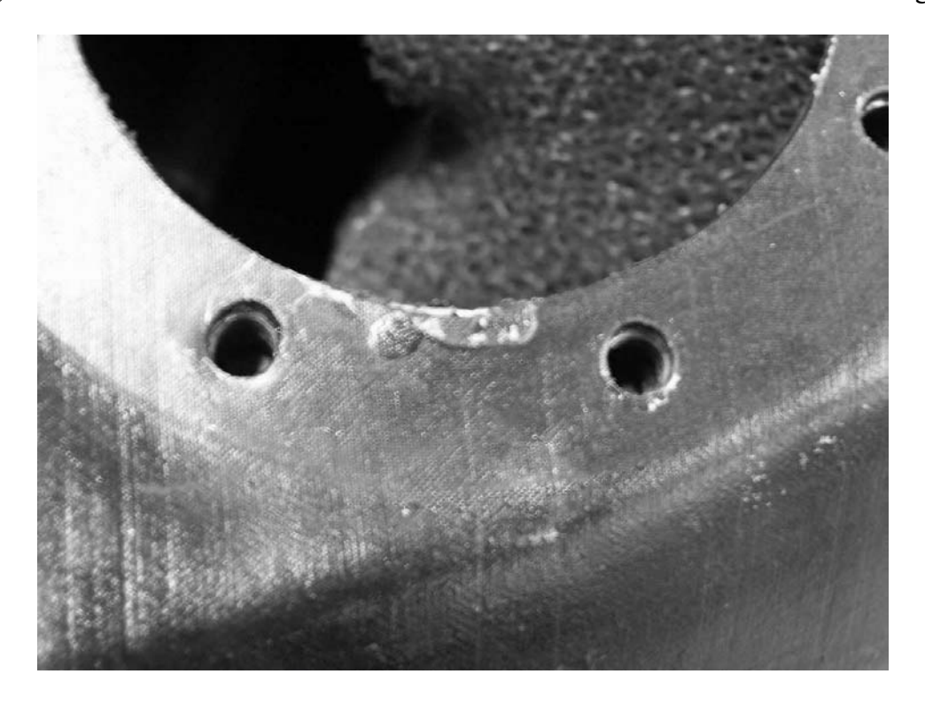
Figure 2 - Interference Result on Fuel Cell