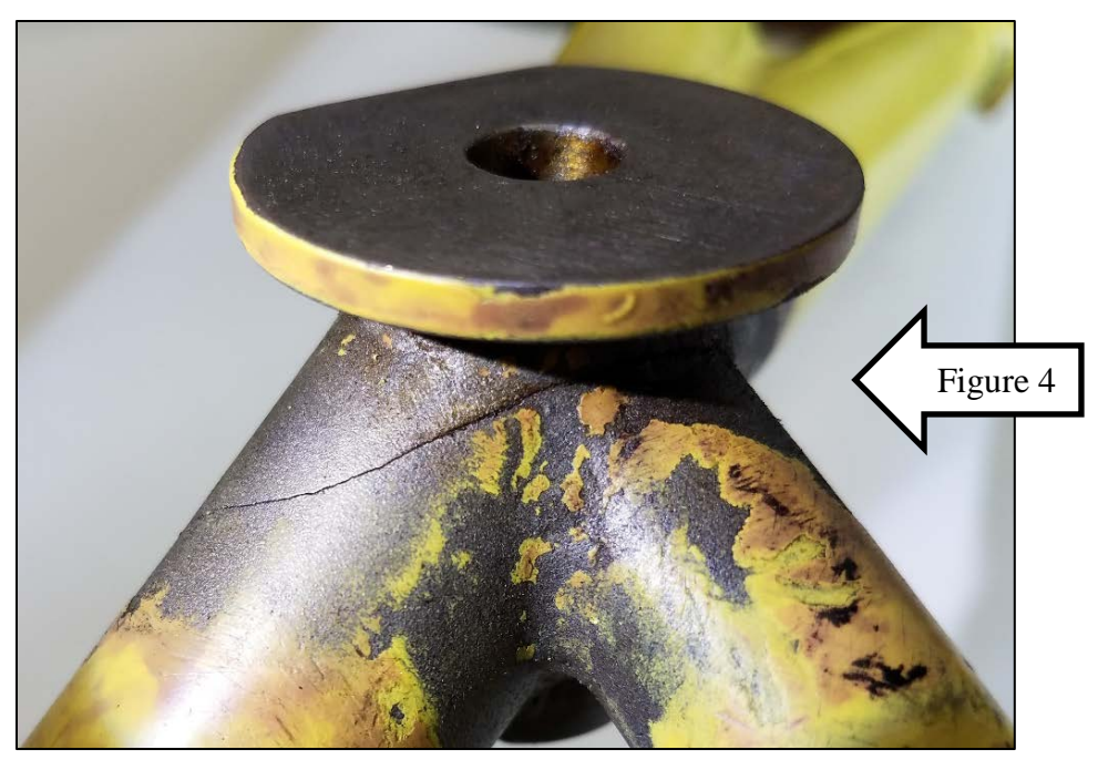
Figure 5. Photograph of Cracked Area – Forward Left Mount - Rotated 90° (Same area as is Figure 3 except mirror was not used; paint/epoxy primer removed)