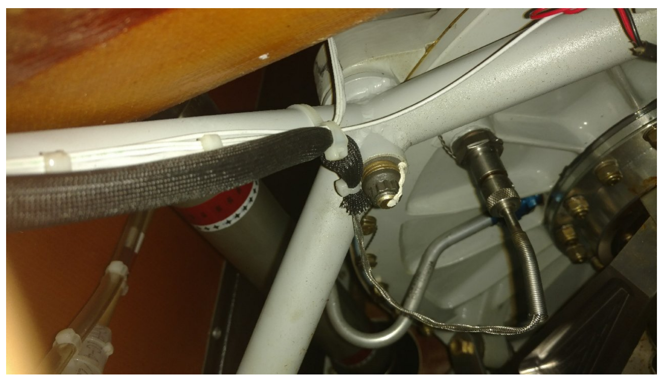
Figure 1. Photograph of Forward Left Mount with Transmission Installed (Photo taken through engine access door)