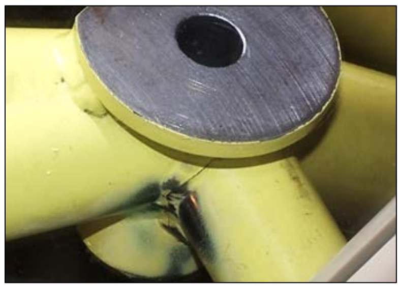
Figure 2. Photograph of Cracked Area – Forward Left Mount (Photo taken using a mirror)