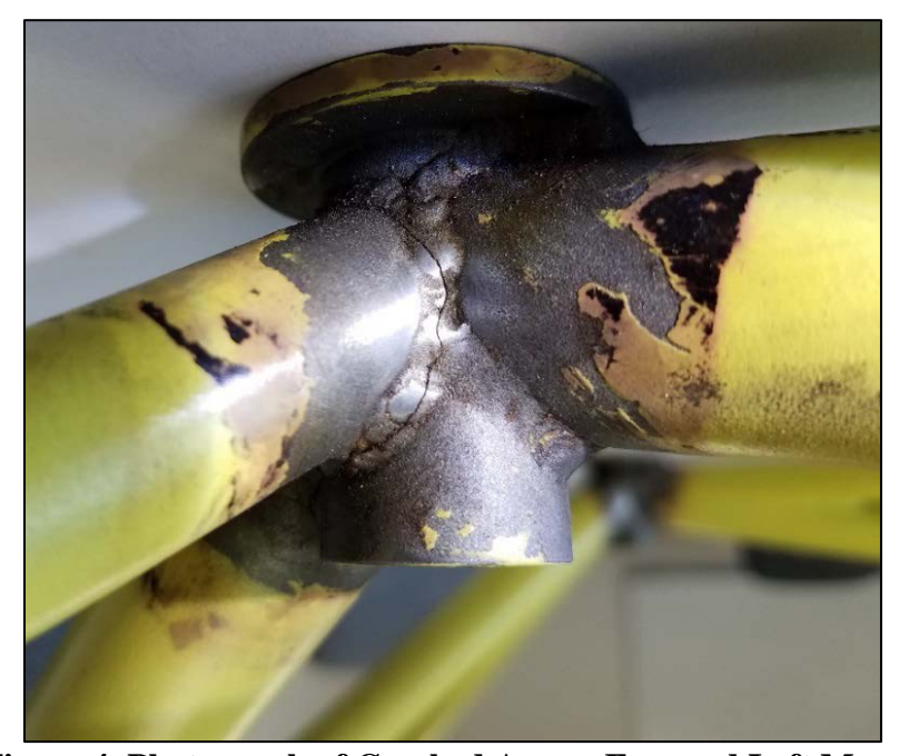
Figure 4. Photograph of Cracked Area – Forward Left Mount (Same area as in Figure 2 except mirror was not used; paint/epoxy primer removed)