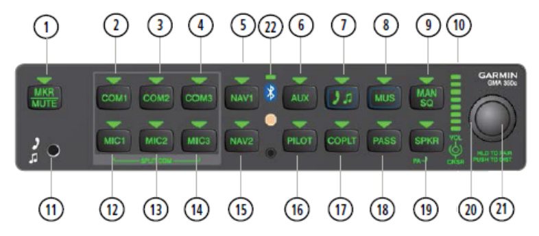
Figure 7-3. GMA 350Hc Controls

The audio panel controls are shown in Figure 7-3. The functions of the audio panel controls are summarized in Table 7-1. When a key is selected, the annunciator above the key is illuminated.