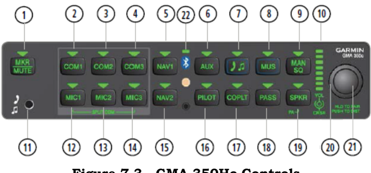
Figure 7-3. GMA 350Hc Controls

The audio panel controls are shown in Figure 7-3. The functions of the audio panel controls are summarized in Table 7-1. When a key is selected, the annunciator above the key is illuminated.