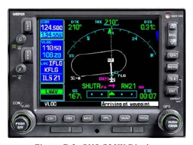
Figure 7-3. GNS 530W Display