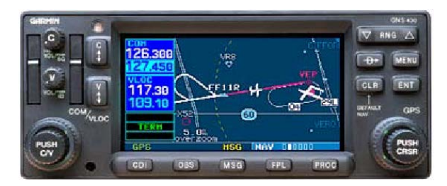
Figure 7-2. GNS 430W Display