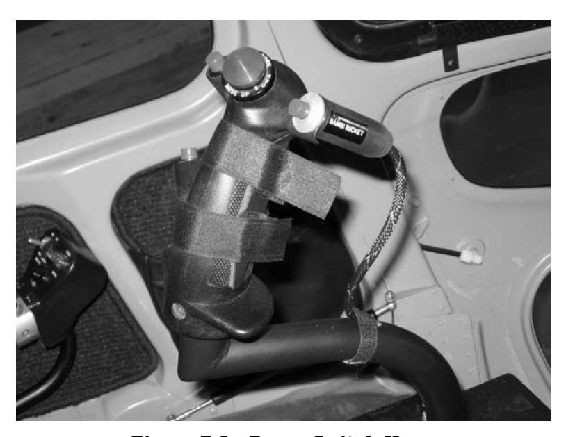
Figure 7-2. Dump Switch Harness