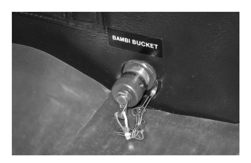
Figure 7-1. Dump Switch Harness Connector