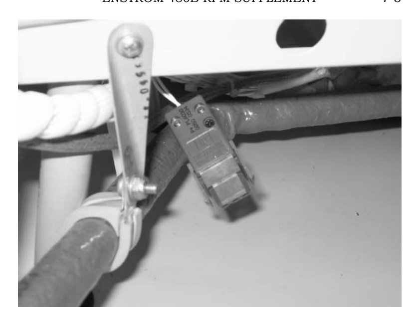
Figure 7-3. Dump Harness Connector