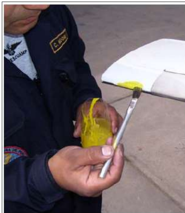
Figure 2. Primer applied to exposed area