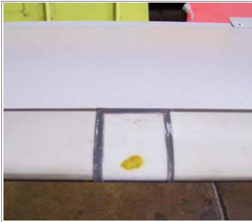
Figure 3. Sealant applied to blade tape repair edges