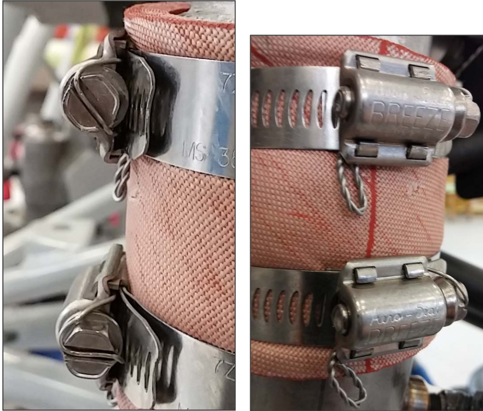
Figure 2. Safety Installation (over the screw slot)