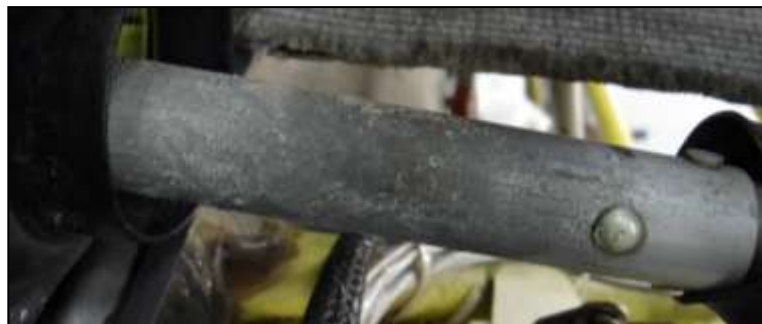
Figure 2. Example of corrosion on a control tube

NOTE: Paragraph 12-7 of the Maintenance Manual may be referenced for additional inspection criteria.