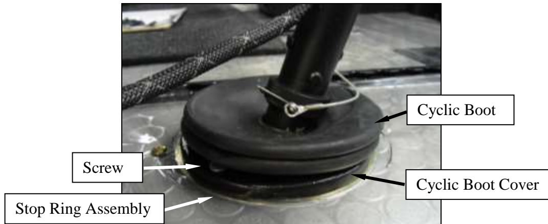
Figure 3. Cyclic boot and cover installation (copilot side shown)