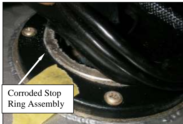
Figure 4. Example of corrosion on the cyclic stop ring assembly

NOTE: Inspect both pilot and copilot cyclic stop ring assemblies.